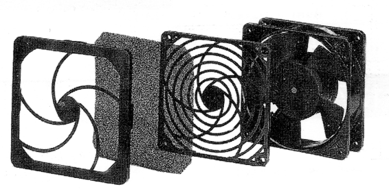
Retainer Media Guard

Snap-in Retainer makes cleaning or replacing media simple. No tools required.